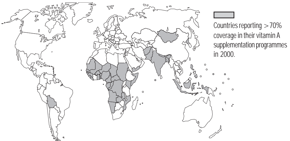
Figure 2: Global distribution of vitamin A supplementation programmes

Vitamin A deficiency and worms both thrive in communities that are poor and therefore the two problems often coexist. In other words, children living in these environments are invariably vitamin A deficient and infected with worms. Delivering deworming tablets and vitamin A supplements at the same time therefore makes logistical sense, particularly for remote communities that are difficult to reach.