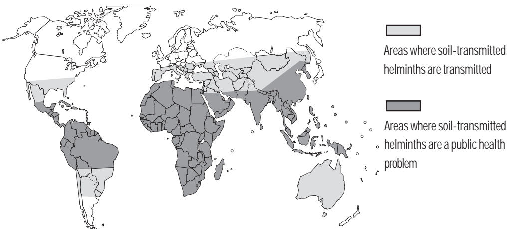
Figure 1: Global distribution of soil-transmitted helminth infections

The global distribution of STH infections is shown in Figure 1. Intense transmission of infection is represented in the areas shaded in dark grey. New estimates have calculated that as many as 230 million children aged 0–4 years are infected (1) (Annex 1).