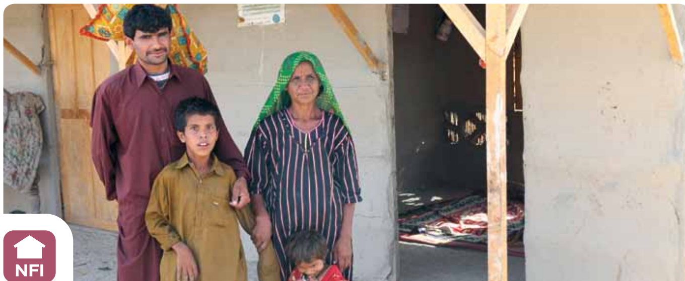
Brice Blonde/Handicap International