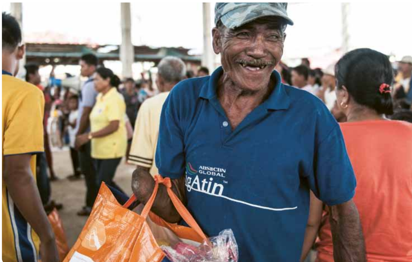
A man having just received emergency relief items, Concepcion, Panay Island, the Philippines after typhoon Haiyan, November 2013.

This pilot version of the Minimum Standards for Age and Disability Inclusion in Humanitarian Action was published by the Age and Disability Consortium, a group of seven agencies working to promote age and disability inclusive humanitarian assistance: CBM, DisasterReady.org, Handicap International, HelpAge International, IFRC, Oxford Brookes University and RedR UK.