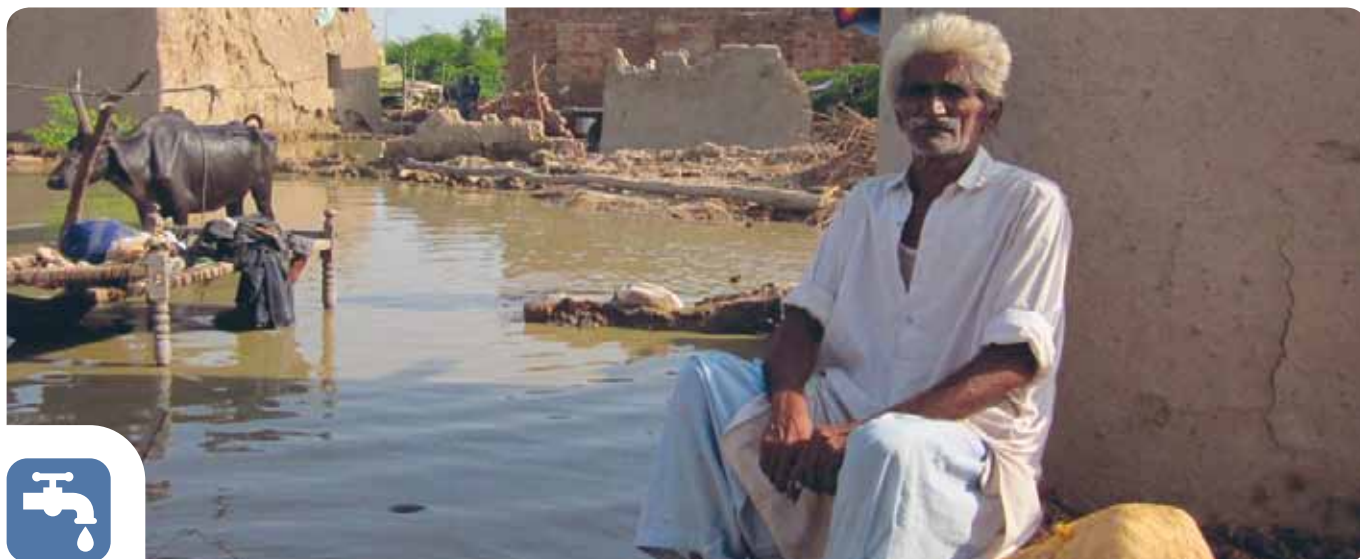
Lucy Bloun/Helppage International